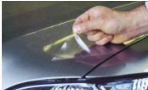
Optical clarity and high gloss

You can't see it, yet VentureShield™ is so tough it's used for abrasion protection on aircraft propellers and rotors!